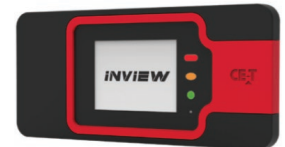
Inview S - Monitoring