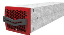
Sierra 25 - 48/230